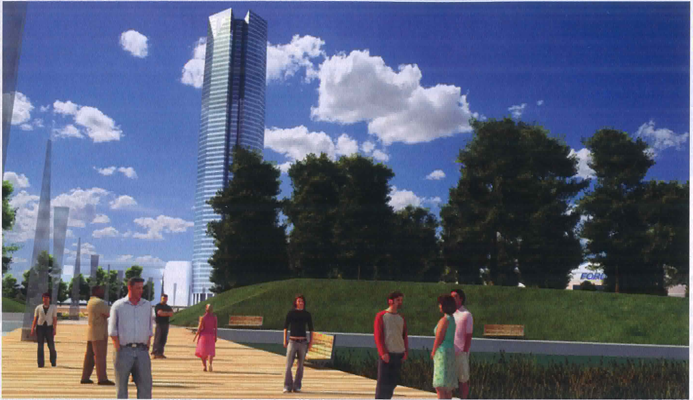
Rendering of the MAPS 3 proposed 70-acre downtown park.

So what has all of this hard work and investment of time and money resulted in? It has resulted in a city that is consistently recognized for its quality of life and affordability as well as a metro that has sported one of the lowest unemployment rates in the nation over the last 10 years.