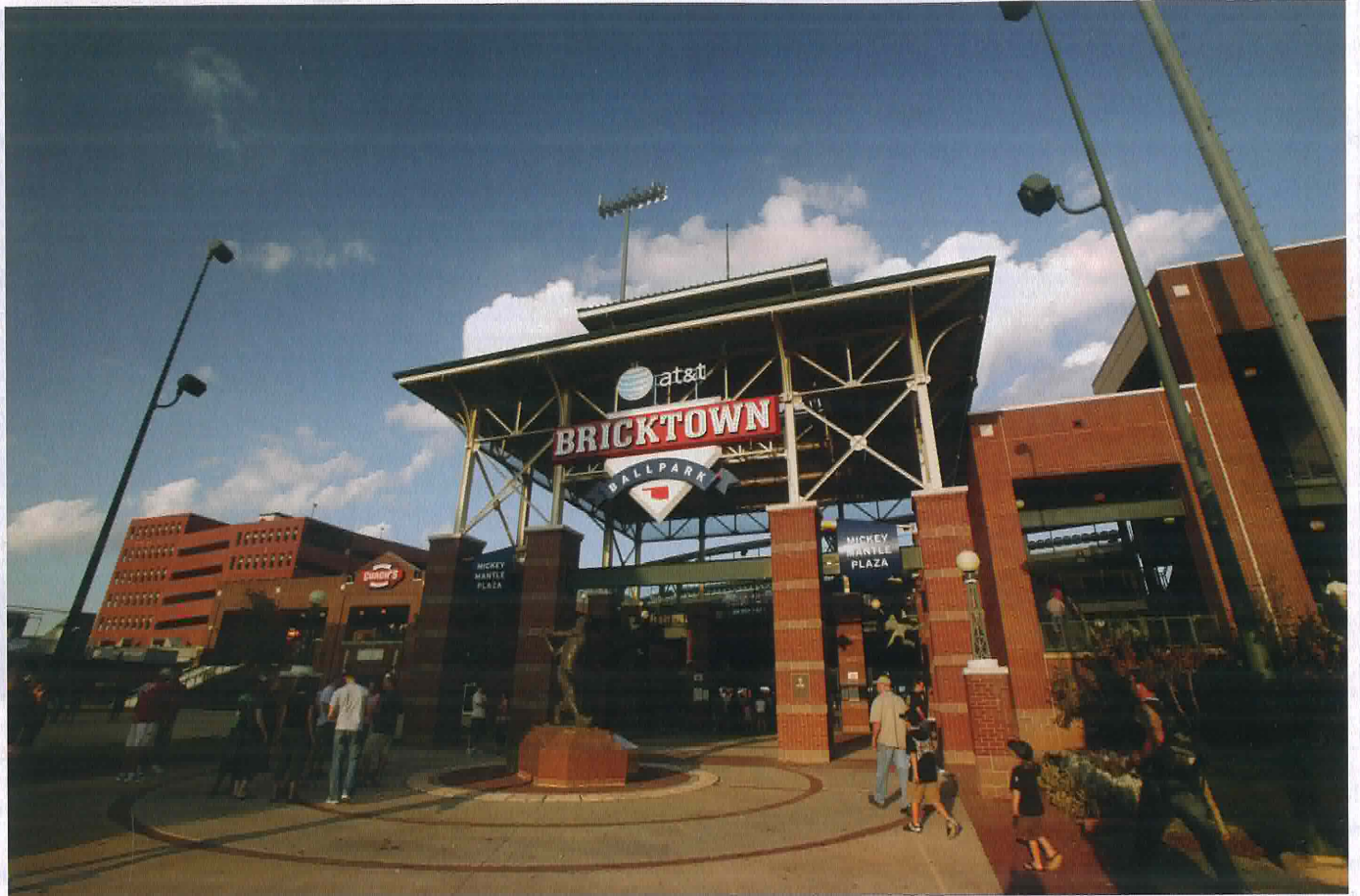
Bricktown Ballpark was created under the original MAPS proposal and is now home to the Oklahoma City Redhawks minor league baseball team.

sales tax and bond initiative known as MAPS for Kids that was used to renovate or replace every school building in Oklahoma City's school district by 2012. Passing by 61%, the program also included major transportation and technology upgrades.