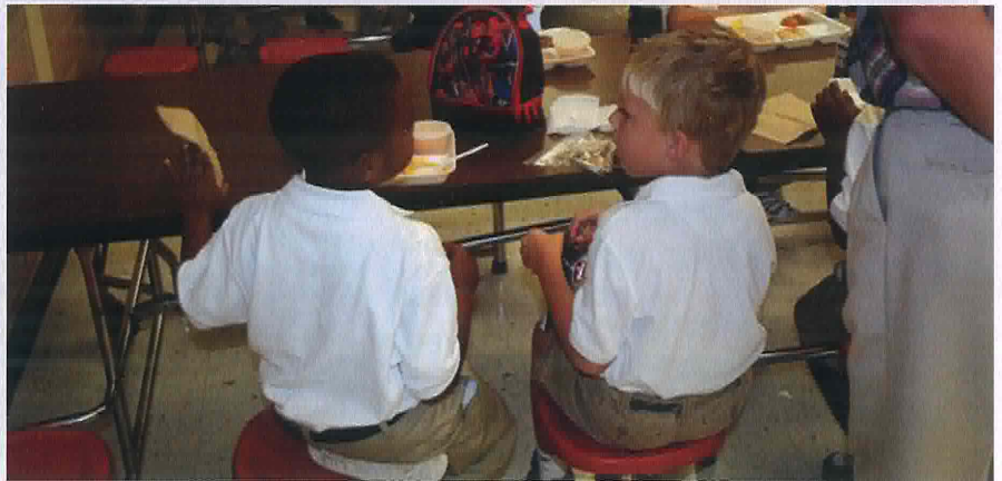
Children at Horace Mann Elementary enjoy their first day back at school after MAPS for Kids renovations.

OKC also has one of the finest rowing venues in the world, a downtown that is busy every night of the week, and an increase in spending by tourists of $1.25 billion over the past 20 years. And the city has the Oklahoma City Citizens to thank for that. That is the reason Southern Business &