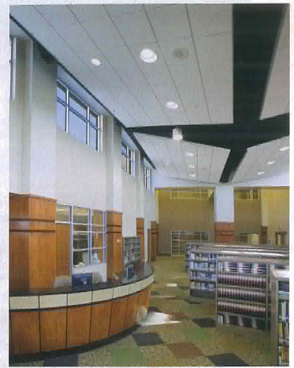
The new Douglass High School was built under MAPS for Kids.

passed by more than 54% of the vote, even in the middle of a recession. Projects include a new 70-acre downtown park, new convention center, and