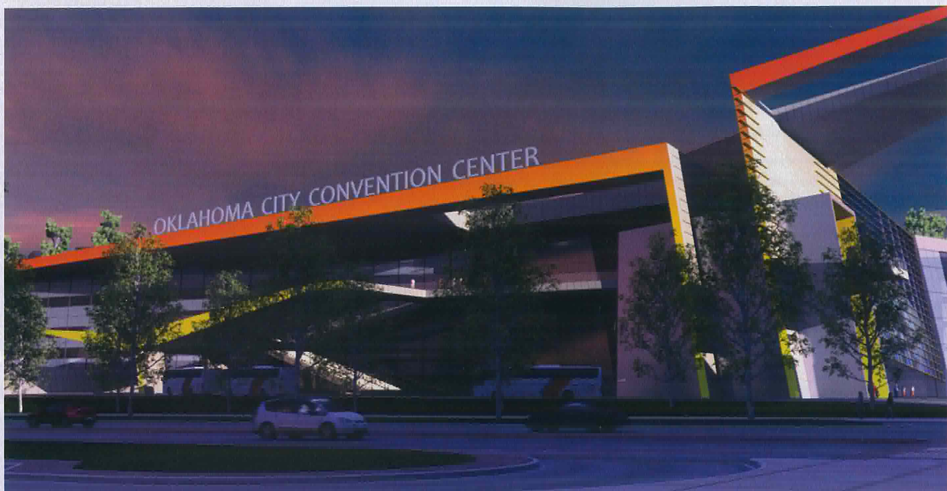
Pictured is a rendering of Oklahoma City's proposed MAPS 3 convention center.

only for cowboys, dust and the overuse of concrete is now being referred to in conversation with phrases like "strong economy," "great quality of life" and "big league city." Oklahoma City did not end up on these lists by accident.